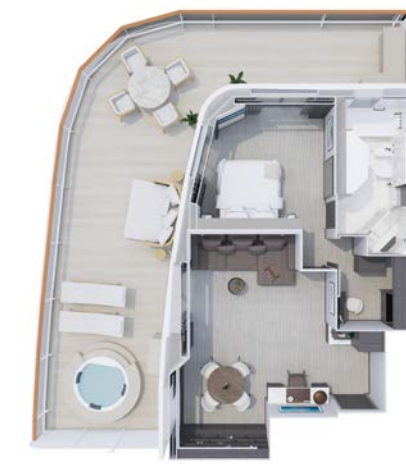
SERENITY RESIDENCE SR

DECK: 7, 9 - Aft NUMBER OF SUITES: 4 MAXIMUM CAPACITY: 3 adults or 2 adults and 2 children under 18 years old