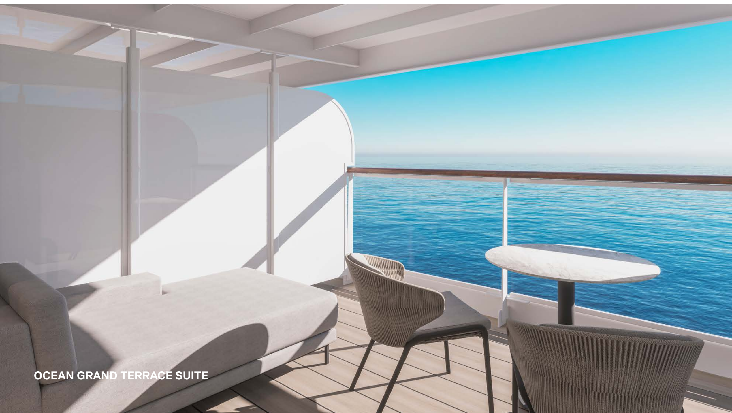
OCEAN GRAND TERRACE SUITE