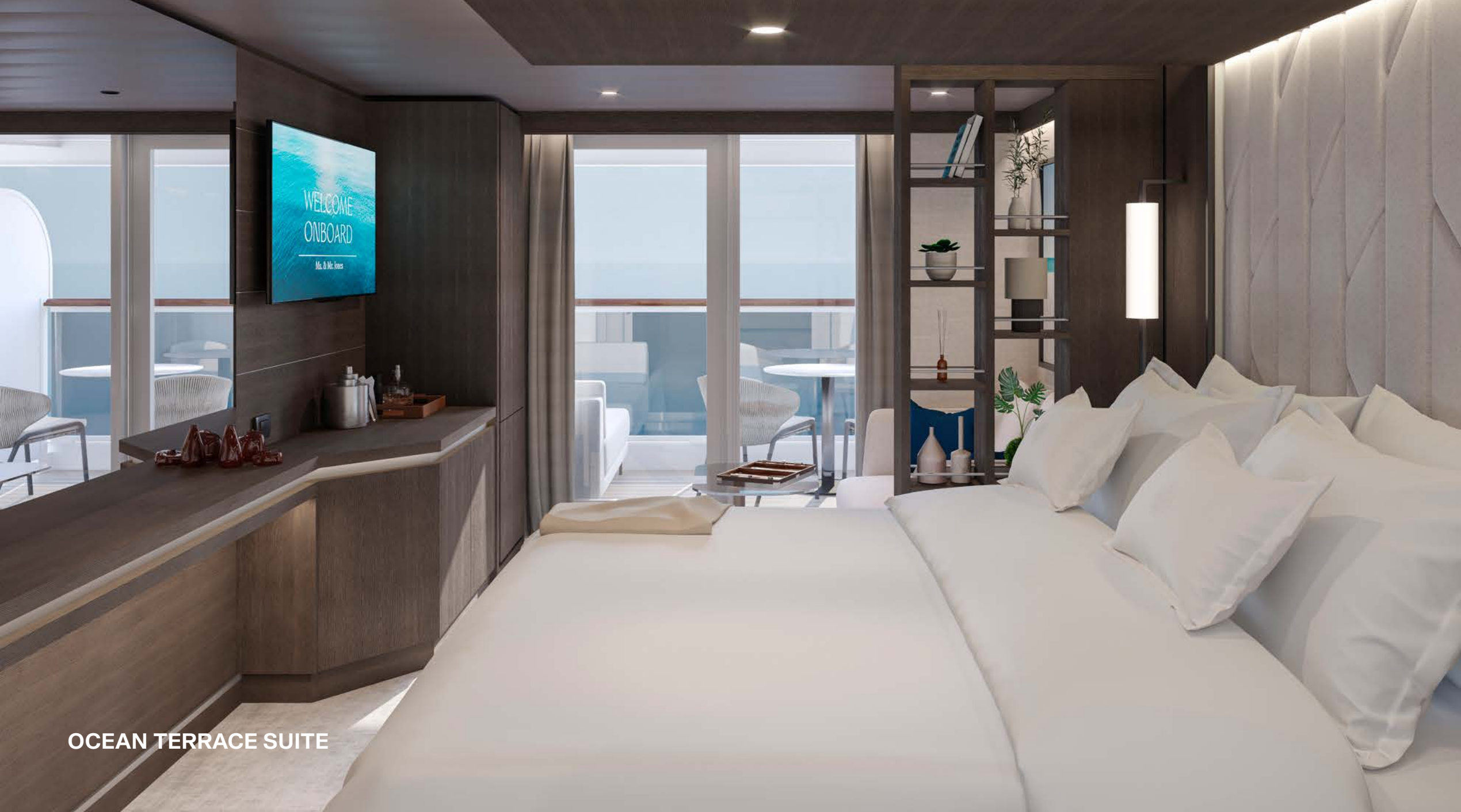
OCEAN TERRACE SUITE