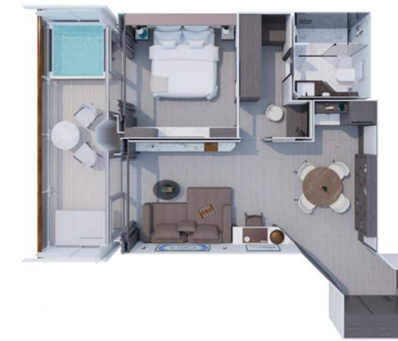
COVE RESIDENCE CO

DECK: 6, 7, 8, 9, 10 - Middle NUMBER OF SUITES: 10 MAXIMUM CAPACITY: 3 adults or 2 adults and 2 children under 18 years old