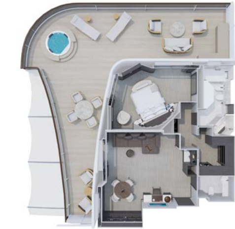
COCOON RESIDENCE CR

DECK: 6 - Aft NUMBER OF SUITES: 2 MAXIMUM CAPACITY: 3 adults or 2 adults and 2 children under 18 years old