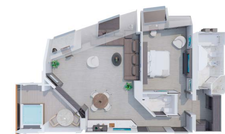
RETREAT RESIDENCE RR

DECK: 7, 8, 9 - Forward NUMBER OF SUITES: 6 MAXIMUM CAPACITY: 3 adults or 2 adults and 2 children under 18 years old